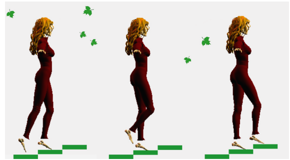
Figure 5: A synthesized stair-ascending motion.

First we model human motions as the composite consequence of the action performed and a motion signature, according to (3). Given a sufficient quantity of motion data,