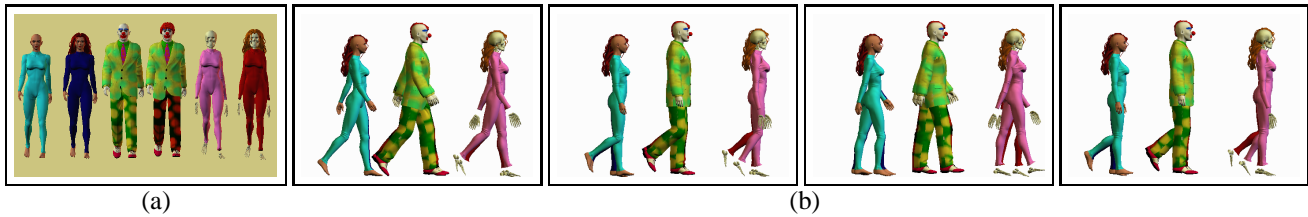
Figure 4: Synthesizing 3 styles of walking motions from example motions of ascending stairs in those corresponding styles. (a) Comparing synthesized walking motion data against ground truth (the synthesized data is depicted by the characters without hair), our method captures stylistic differences in motion such as pigeon-toed walking, knocked-knees or strutting. (a) The synthesized motions are depicted by the characters in the foreground and, for comparison, the captured walking motions are depicted by the characters in the background.

graphical characters shown are modeled and rendered by the MetaCreations Poser system.