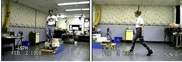
Figure 3: The motion capture facility

Comparing our multilinear technique to conventional PCA, the latter would decompose a motion data matrix whose columns are observed motions \mathbf{d}_i into a reduced-dimensional basis matrix \mathbf{B}_{\text{PCA}} made up of the most significant eigenvectors times a matrix \mathbf{C} containing a vector of coefficients c_i for every observed motion. PCA represents each person as a set of M coefficient vectors, one for each action class. By contrast, our multilinear analysis enables us to represent each person with a single vector of coefficients relative to the bases comprising the tensor \mathcal{B} defined in (4).